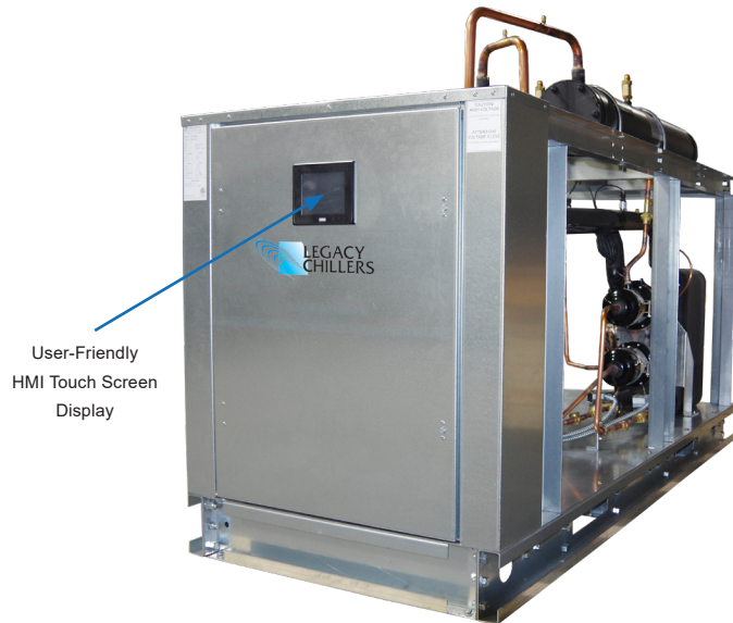
User-Friendly HMI Touch Screen Display