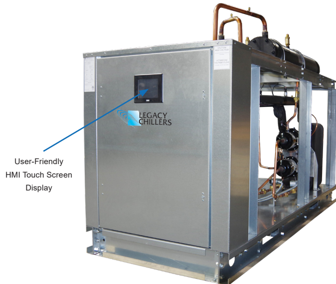
User-Friendly HMI Touch Screen Display