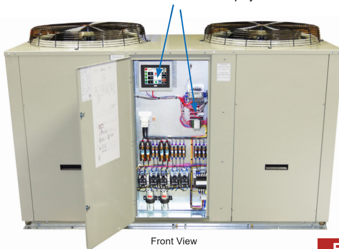
Front View (Electrical Cabinet Open)

STANDARD ON ALL LEGACY CHILLER MODELS: Pentra Microsmart, Programmable Logic Controller (PLC) with HMI Touch Screen Display.