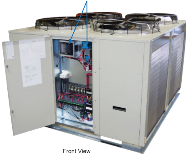
Front View (Electrical Cabinet Open)

STANDARD ON ALL LEGACY CHILLER MODELS: Pentra Microsmart, Programmable Logic Controller (PLC) with HMI Touch Screen Display.