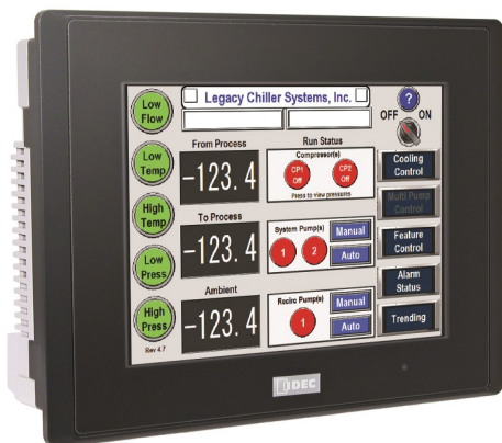
Legacy - HMI touch screen with built in web-