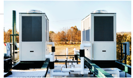
Shown Above: Installed Air-Cooled Scroll Chillers

Applications include but not limited to: