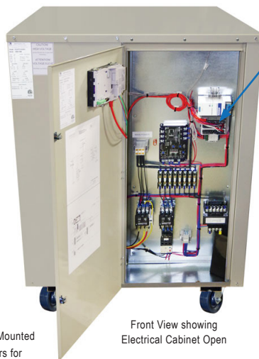
Front View showing Electrical Cabinet Open