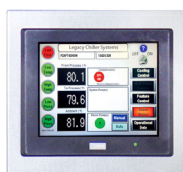
Easy to Use Touch Screen Display on all Legacy Chiller Models