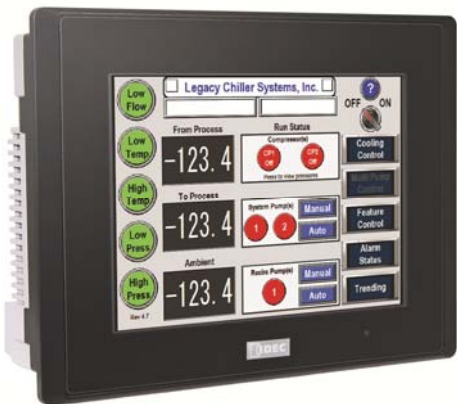
Legacy - HMI touch screen with built in web-