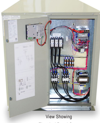
Electrical Panel Open

Pentra Microsmart, Programmable Logic Controller (PLC) with HMI Touch Screen Display.